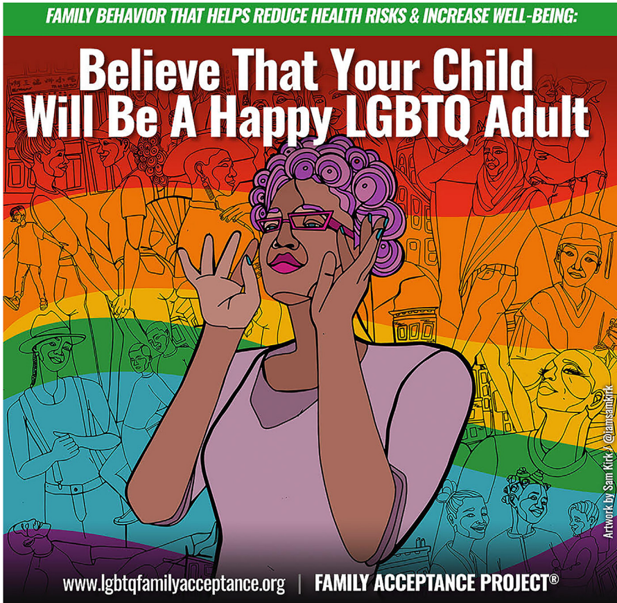
Fig. 2. Family Acceptance Project meme— Believe—about here.