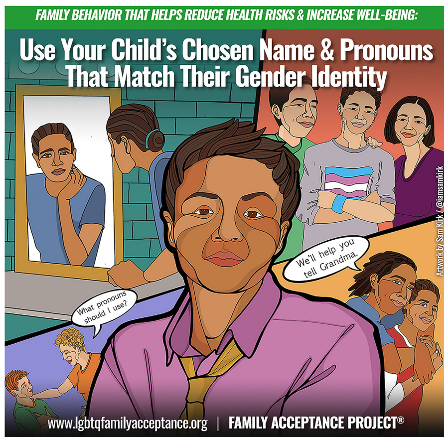
Fig. 3. Family Acceptance Project meme—Using Names and Pronouns—about here.

Similarly, when engaging parents of TGD youth, the clinician will explore their understanding of gender identity development and how it may be related to their child's trauma experience. Be mindful that while visibility and representation of TGD people have increased, parents may feel confused about how gender identity is expressed in childhood. Clinicians may find it helpful to further explore information shared during